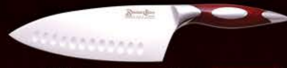
7" Asian Cleaver: $189