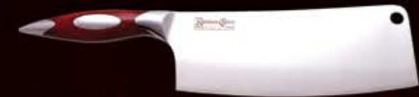
8" Cleaver: $219